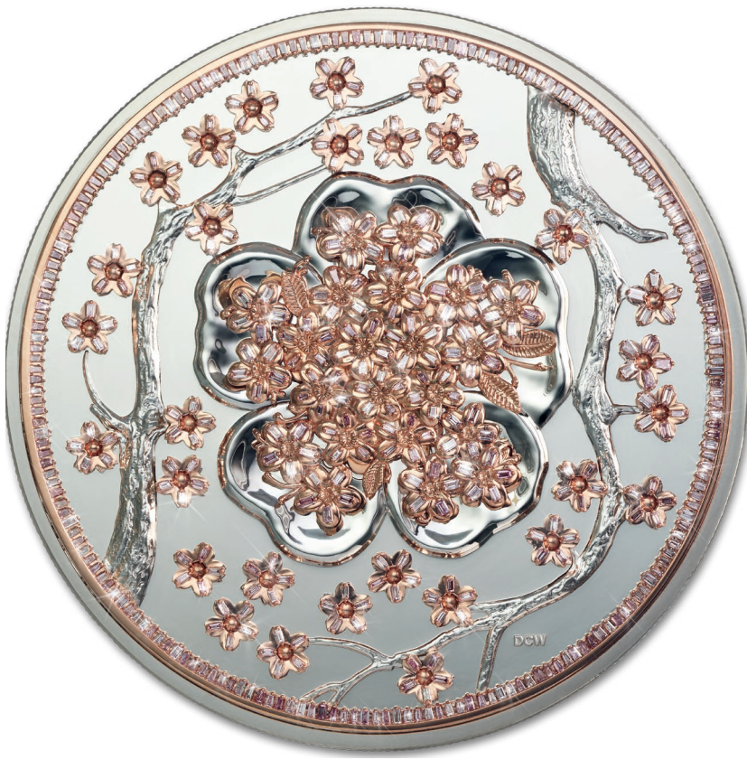
ABOVE: ROYAL CANADIAN MINT , The Ultimate numismatic coin 101.6 millimetre diameter Sold May 31, 2022 for $1,261,250