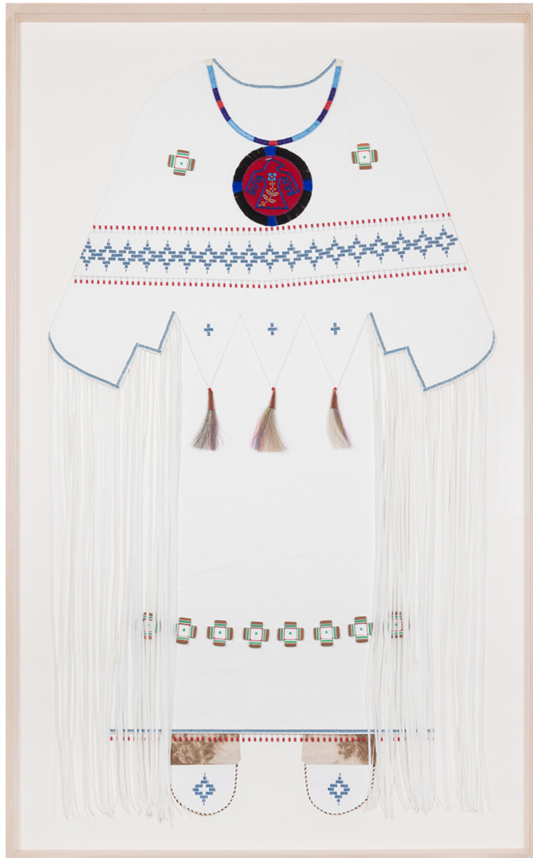
Buckskin (2021) 172 x 99 cm, Lokta Nepalese handmade paper, Pellon, capacitors, resistors, light-emitting diodes, porcupine quill, horsehair, velvet, rope, glass beads and bias trim. Collection of the Artist.